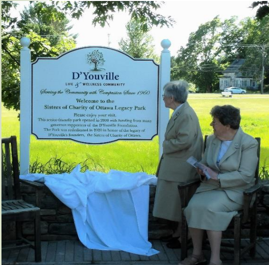
The sign that greets visitors to the park

Although this celebration had been scheduled for a year, it was postponed due to the arrival of the COVID-19 pandemic. The ceremony and dedication of the park at the D'Youville Life and Wellness Community honoring the legacy of the Sisters of Charity of Ottawa actually took place in the afternoon of June 24, 2021 under a blue sky and a warm sun.